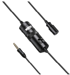
BY-M1 Universal Lavalier Microphone